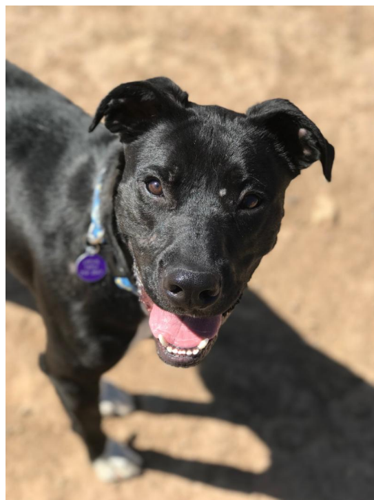
Cole is available for adoption!

Dress appropriately for weather, bring plenty of water, and a collapsible dog bowl for your furry companion.