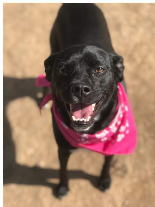
Pepper is available for adoption!

We all know professional athletes practice the basics over and over again. Basketball players tout the importance of dribbling and free-throw practice. Military and police do so much with their weapons, that it feels odd for them to do anything without them. Dog trainers aren't any different. We've run so many dogs through manners training that many elements have become second nature to us.