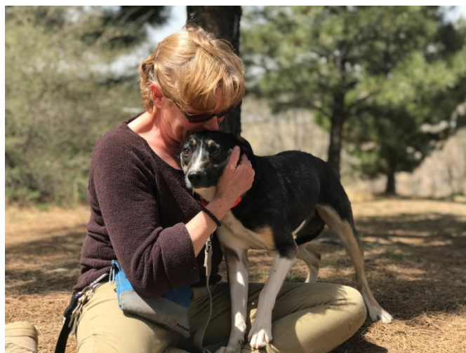
Marcy & Lady

Level 1: Covers basic impulse control, communication and cues. This is a great place for dogs to have to focus on their family....with other dogs extremely close to them. Kids are always welcome!