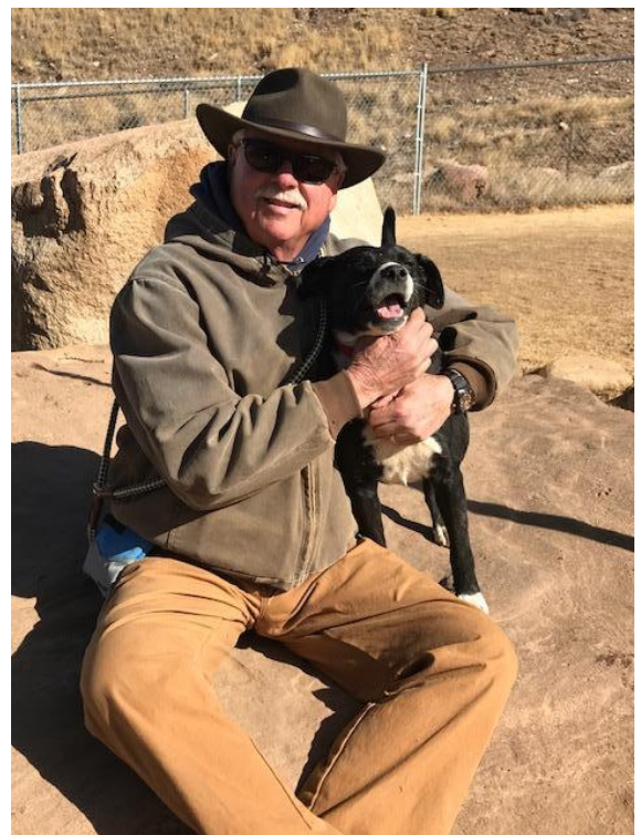
Ken & Rolo Rolo is available for adoption!

Most everyone who comes into the shelter wants the "ready-made", "easy-peasy" dog. This perfect canine is not too big, not too small, great with kids, cats, other dogs, house-trained, doesn't pull on the leash and is crate-trained. The dogs needs to sit, stay and come on command, as well as not bark, chew, dig, destroy furniture, or shed. Oh, and it would be really great if it didn't need to be walked much and is happy being alone.