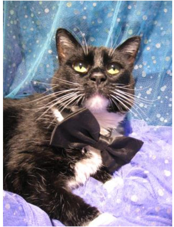
Tux is available for adoption!

This sweet senior has been a resident of ours for far too long and we would like to see him live out his golden years in comfort and style. A lover of laps, naps and 90's raps! (Just kidding, well maybe, we don't know for sure.) We do know that this guy will make a wonderful companion! Carefree, gentle and a master cuddler, he has got it all. He is friendly with other cats and dogs, and would do just fine in a multi-pet family. Kids, you ask? He loves the kiddos. His one preference would be to stay indoors, as he has done the "outdoor" thing in is youth and now enjoys the warm and comforting surroundings of an indoor environment.